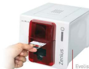
Evolis ZENIUS printer