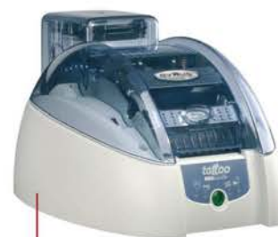
Evolis TATTOO RW printer